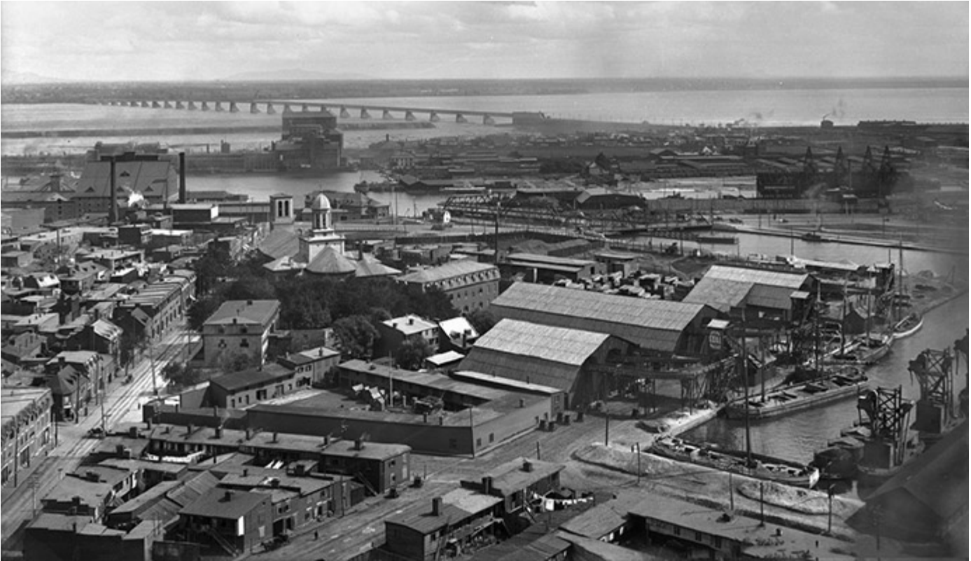
Griffintown in 1896