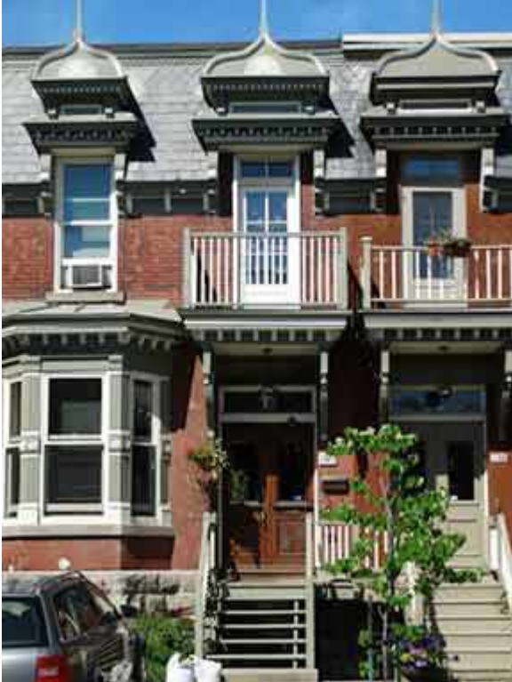
107 Blenheim Place

“Founded in the middle of the 19th century, the Dominion Bridge Company built all of Canadian Pacific’s rail bridges between Montreal and Vancouver. Over the years, this major company honed its steel expertise by working on many major structures, such as the Quebec Bridge, the Champlain Bridge, the structure of the Château Frontenac, the Mount Royal Cross and, of course, the Jacques Cartier Bridge...”