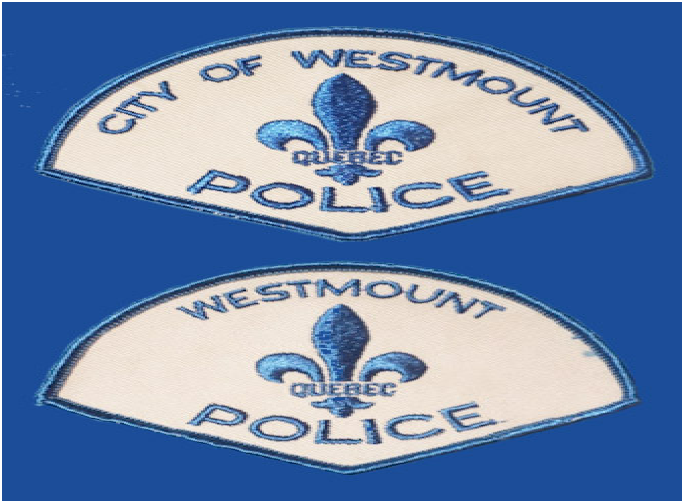
Image 12: In 1970, the Quebec Government mandated that all police forces wear the same uniforms and cloth insignia. These patches are referred to as BNQ patches for the agency charged with regulating such insignia (the Bureau de Normalisation du Québec). As far as I know, Westmount was the only municipality in the province to include the designation (City/Town, etc.) only in English. Another version of the BNQ patch featuring only the city's name.

Images and annotations: John Carroll (johncarroll8238@hotmail.com) Feature image: montage by Andrew Burlone