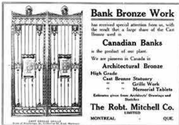
Ad in Construction, November 1916