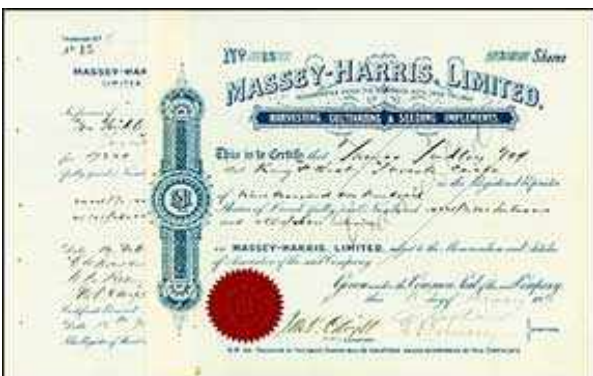
Share of Massey-Harris

A decade earlier, Daniel Massey opened a blacksmith and farm implement shop in Newcastle, Ont. In 1867, Massey started exporting products overseas with the first shipment of reapers and mowers being shipped to Germany.