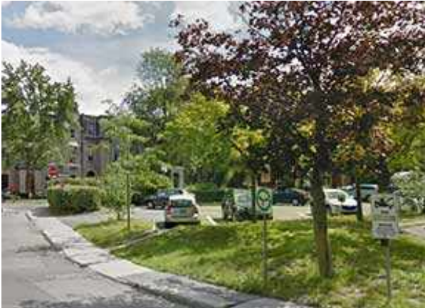
Parking lot at Gladstone and Dorchester