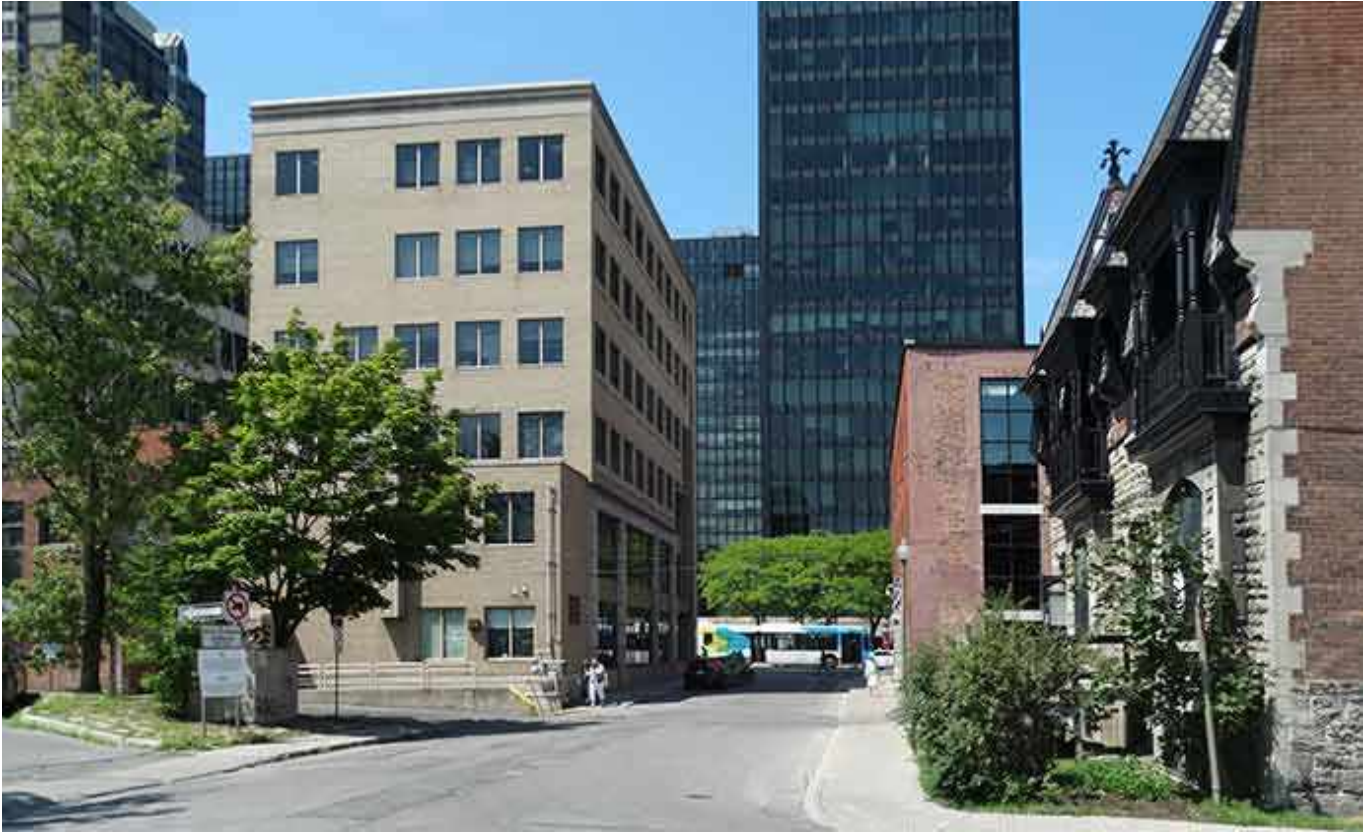
Gladstone Avenue looking northward from Tupper

Termed "Urban Renewal", the scope of which is quite staggering – the extent of the expropriations are well described in Council Minutes: