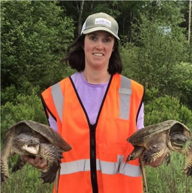
Turtle Guardians volunteer with Snapping turtles