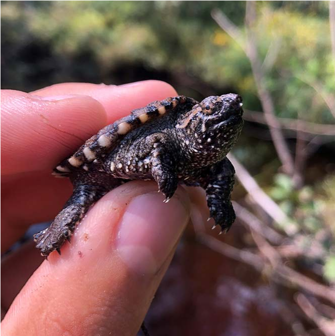
Turtle hatchling released into nature

However, that relationship which started on equal terms now has humanity, through its various activities, serving as the primary cause for the severe decline of turtle populations across the planet, including the eight freshwater turtle species that inhabit Eastern Canada. These are disappearing rapidly due to being killed by cars running over them; habitat loss – the ongoing destruction of wetlands, forests, and fields, including critical nesting and hibernation sites; the construction of roads in prime turtle habitat; pollution; and other factors that, when combined, have led to extirpation in many areas and overall declines. The loss of even one turtle can be catastrophic especially when there are so few and the survival rate of hatchlings into mature adults is low even in the most ideal conditions.