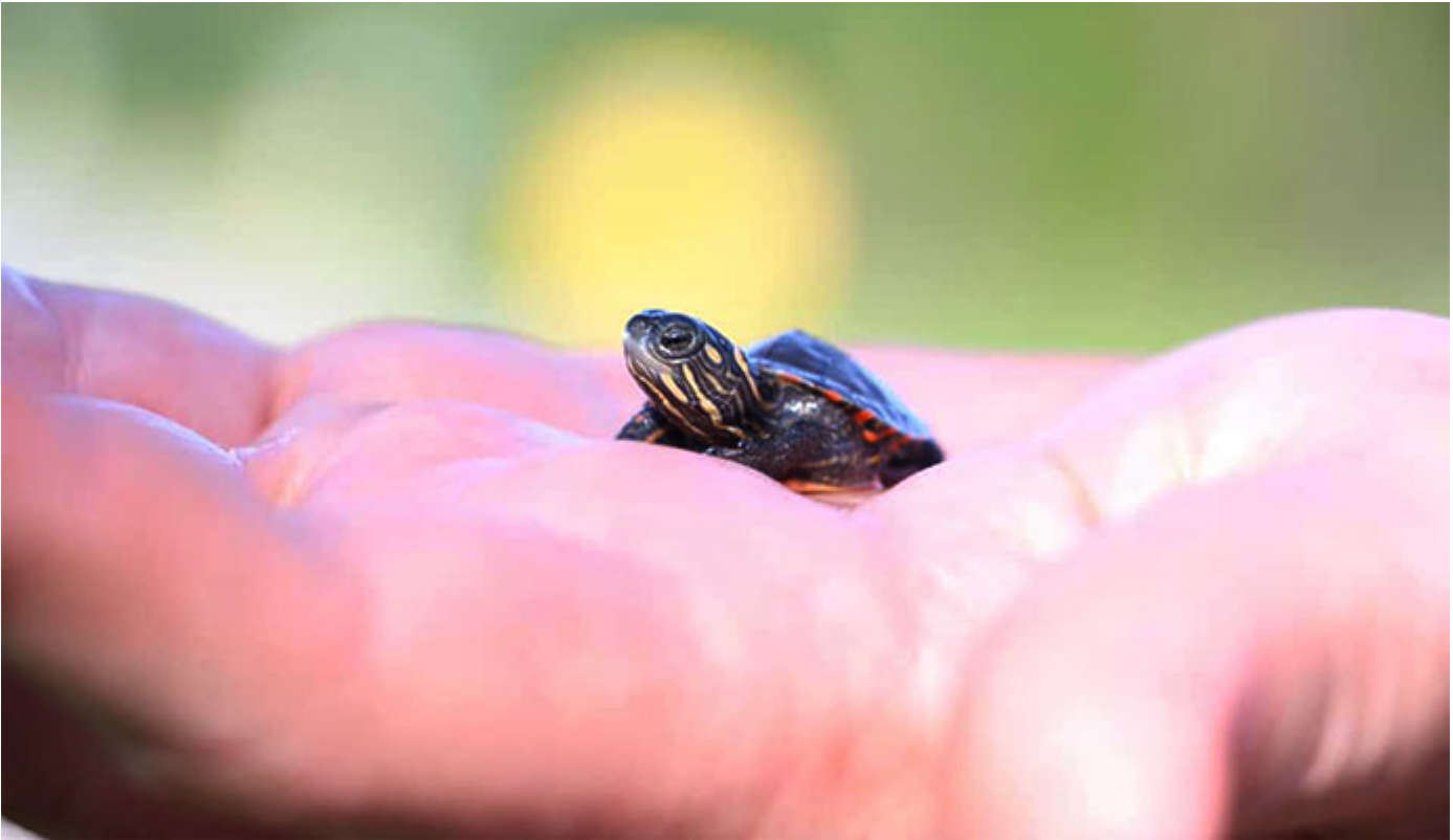
One tiny Painted turtle hatchling