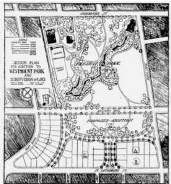
Westmount Park Plan 1910

What could have been – and should have been.