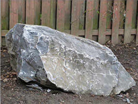
Westmount Park – Boulders

Our composition consists of the following ingredients, combined in the proportions stated, viz: Chili pepper, twenty percent; kullabara, five percent; sulphate of lime, eight percent; phosphate of lime, eight percent; carbonate of lime, eight percent. This mixture is thoroughly mingled and makes a fine powder.”