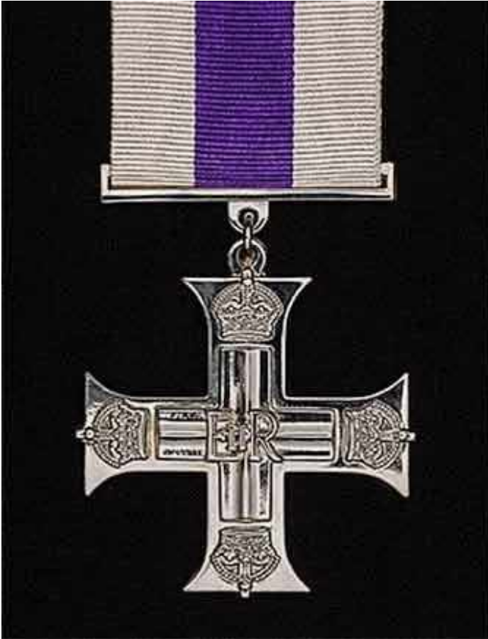
Military Cross with Bar

“He had a distinguished war record, receiving the Military Cross with Bar. He went overseas with the 134th Battalion as major and he reverted to the rank of captain to go the France where he served with 19th Battalion.” Montreal Gazette, February 18, 1927