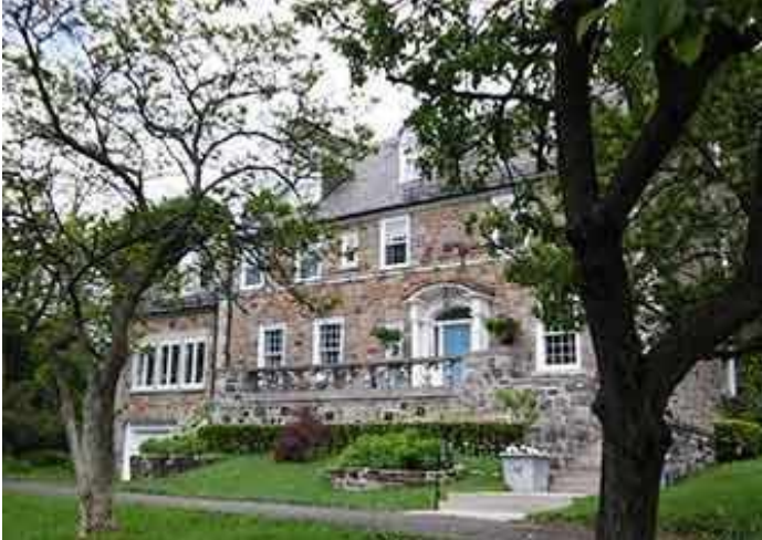
10 Braeside Place

“Died in office on December 14, 1940, during rescue operations in the Atlantic Ocean following the torpedoing of the liner Western Prince, age 53 years and 2 months. ”