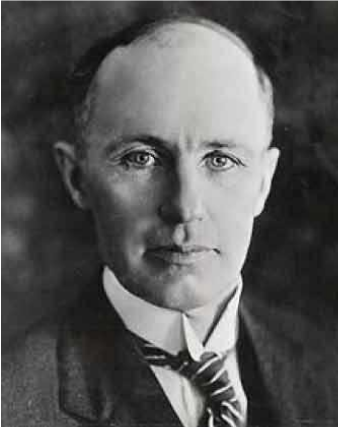
Right Honourable Arthur Meigen PC QC