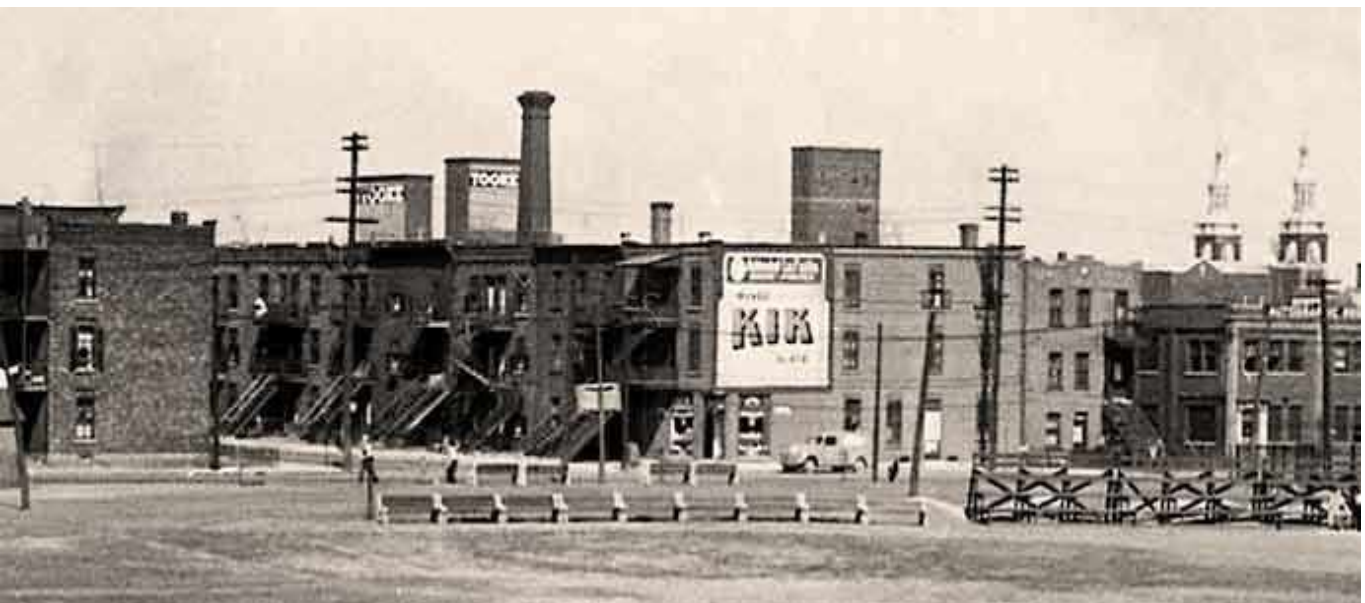
Tooke Brothers factory on de Courcelle (1945)