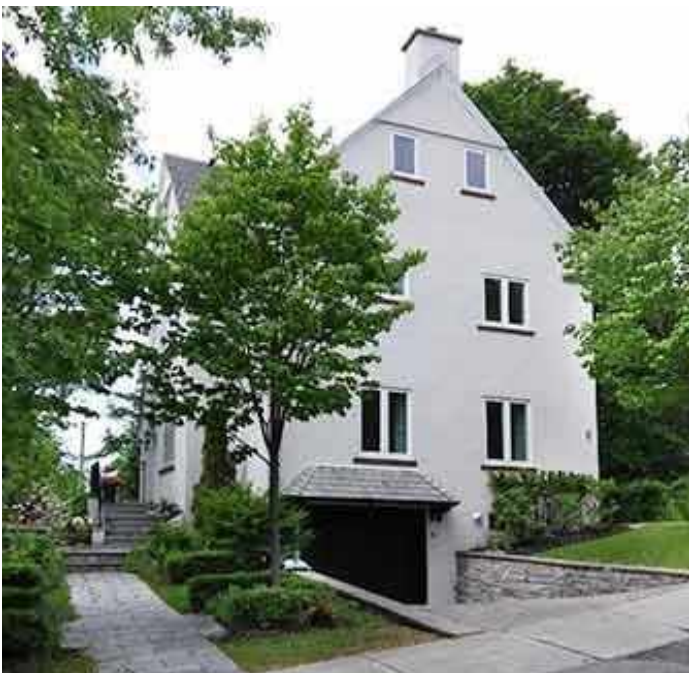
6 Braeside Place

Request made, in 1968, by The Study Corporation to the City of Westmount to amend By-Law 655 allowing them to use 5 Braeside Place for school purposes.