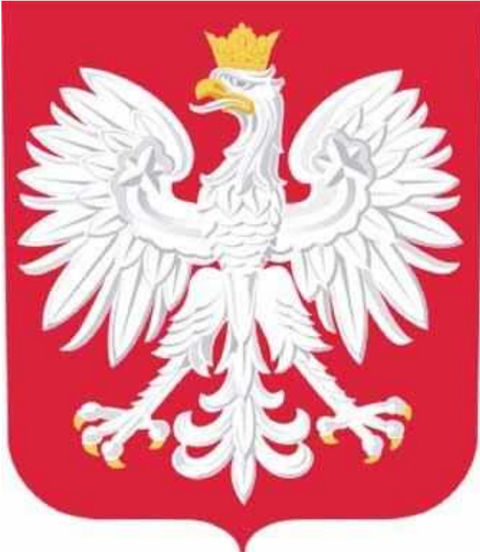
Polish coat of arms

The house was sold, in 2019, for $9 million to a New York-based buyer with children attending school in Montreal.