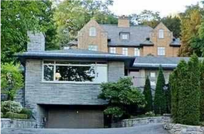
7 Braeside Place