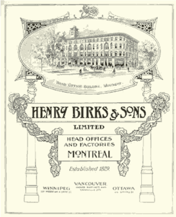
Ad for Henry Birks & Sons