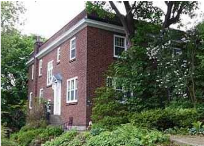
16 Braeside Place

Senior partner of Touche Ross & Co., chartered accountants and director of BP Canada Limited. In addition, governor of the Boys' Home of Montreal (Weredale House) and the Royal Victoria Hospital.