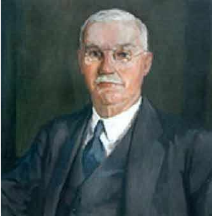
Thomas B. Macaulay