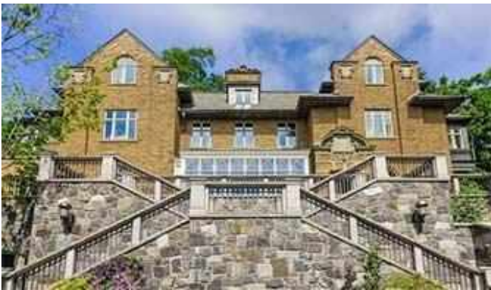
9 Braeside Place

“Your Committee recommends that a permit be granted for the use of 9 Braeside Place belonging to the Estate A. F. C. Ross, as a residence for Polish War Refugees...” (1942)