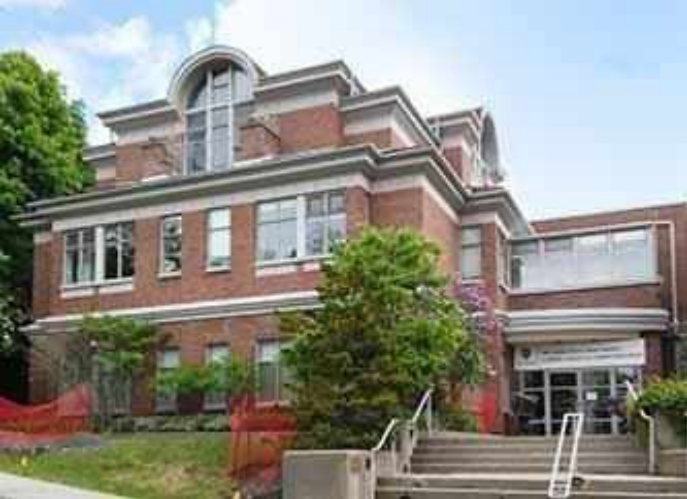
5 Braeside Place