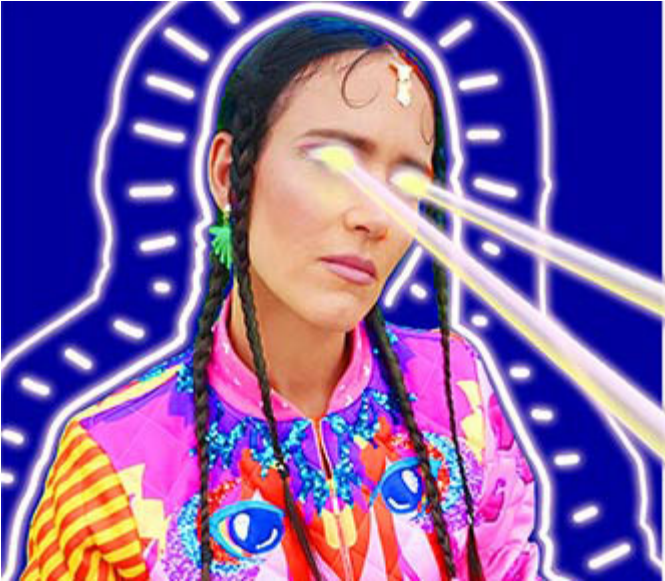
La Chica