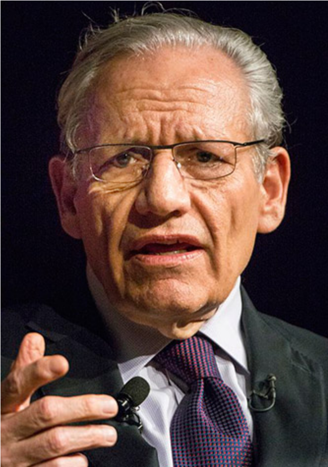
Bob Woodward

On the eve of a threatened demonstration at the U.S. capital on September 18 to protest the “political prisoners” held for trial as a result of their violent actions on January 6, and the oft postponed date of September 20 as the date when Donald Trump will be re-instated as U.S. president, it is timely that a new book, Peril , by Bob Woodward and Robert Costa , has been published.