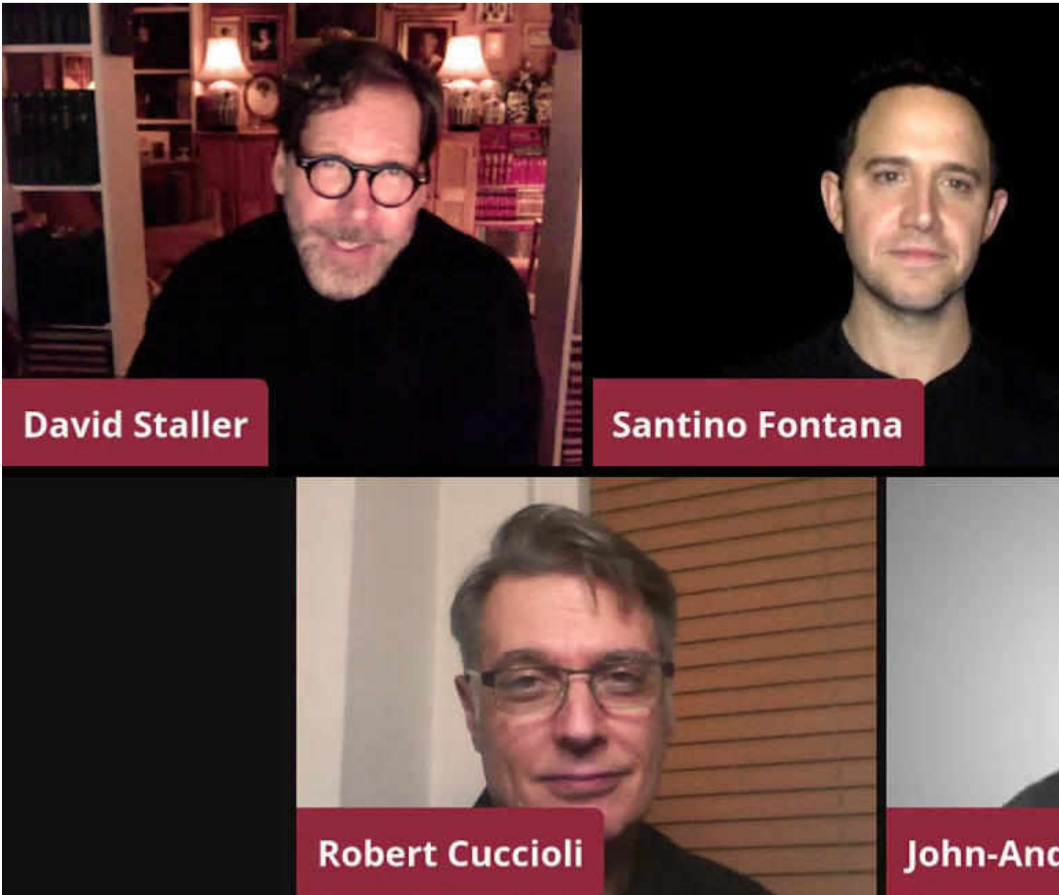
The online reading of Man and Superman

Man and Superman was streamed until November 20.