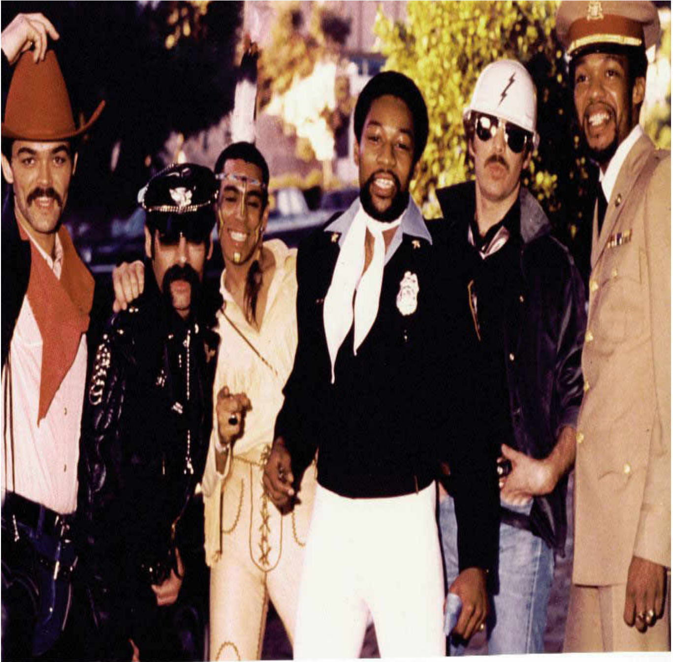
Village People are among the groups who protested the use of their music