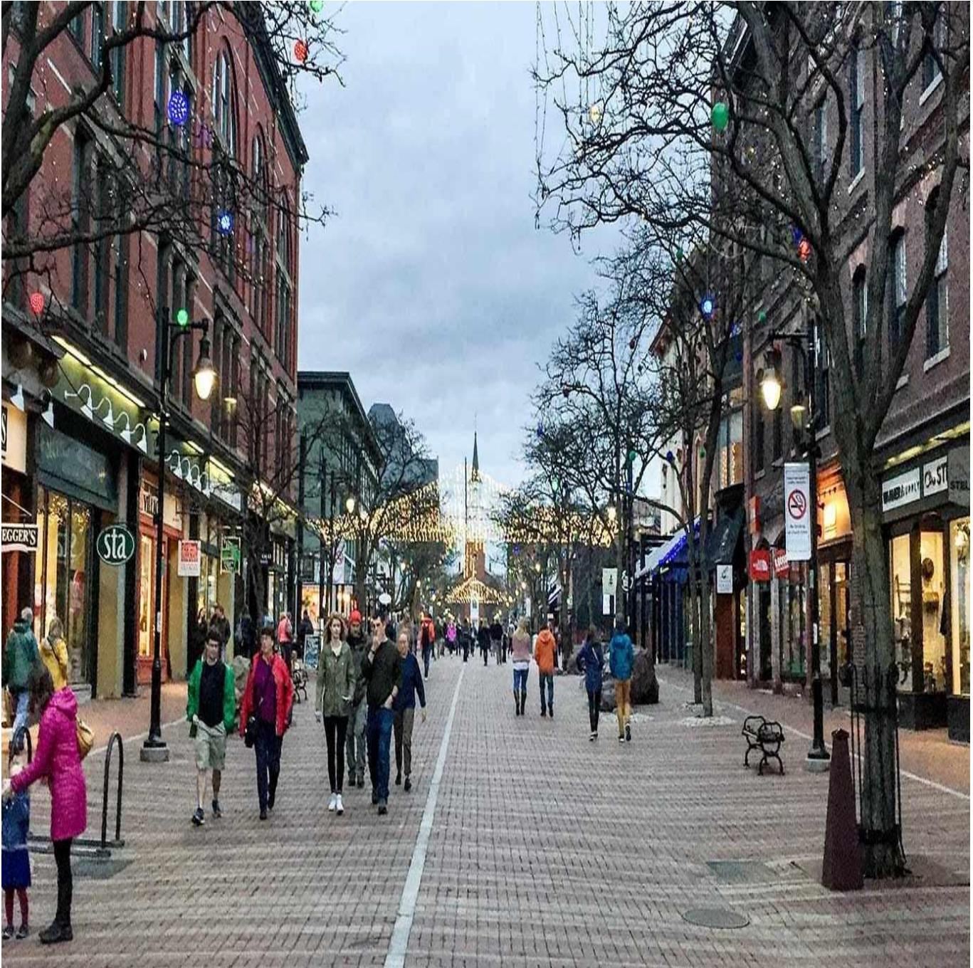
Burlington, VT, one of the cities that were not reimbursed for expenses related to Trump rallies