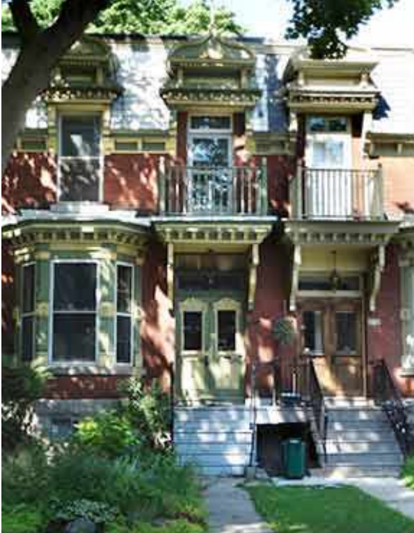
115 Blenheim Place