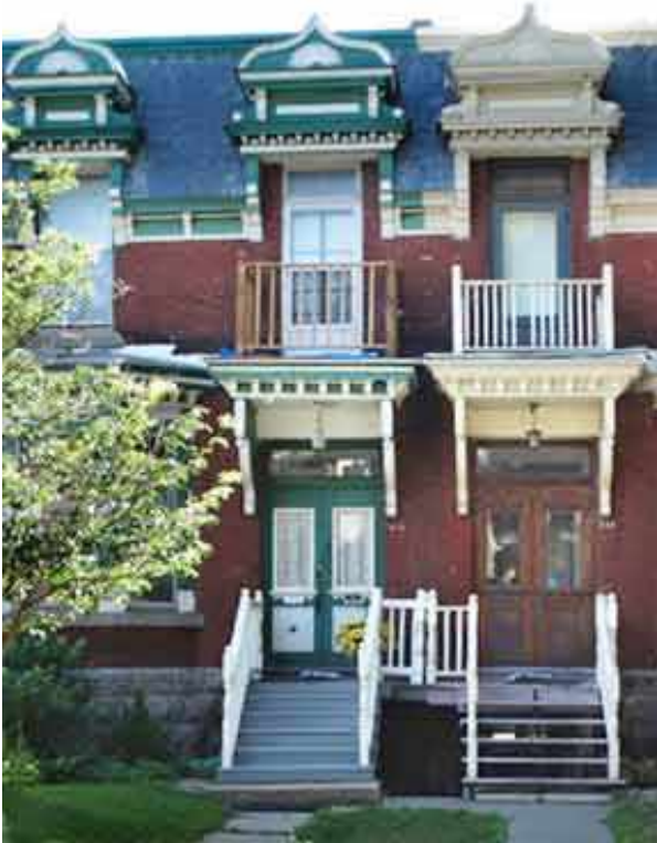
110 Blenheim Place