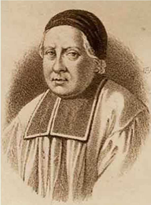
François Vachon de Belmont (circa 1700)

Walking along the street, I am reminded of the Brothers Grimm 1812 tale of Hansel and Gretel and their discovery of a cottage built of gingerbread.