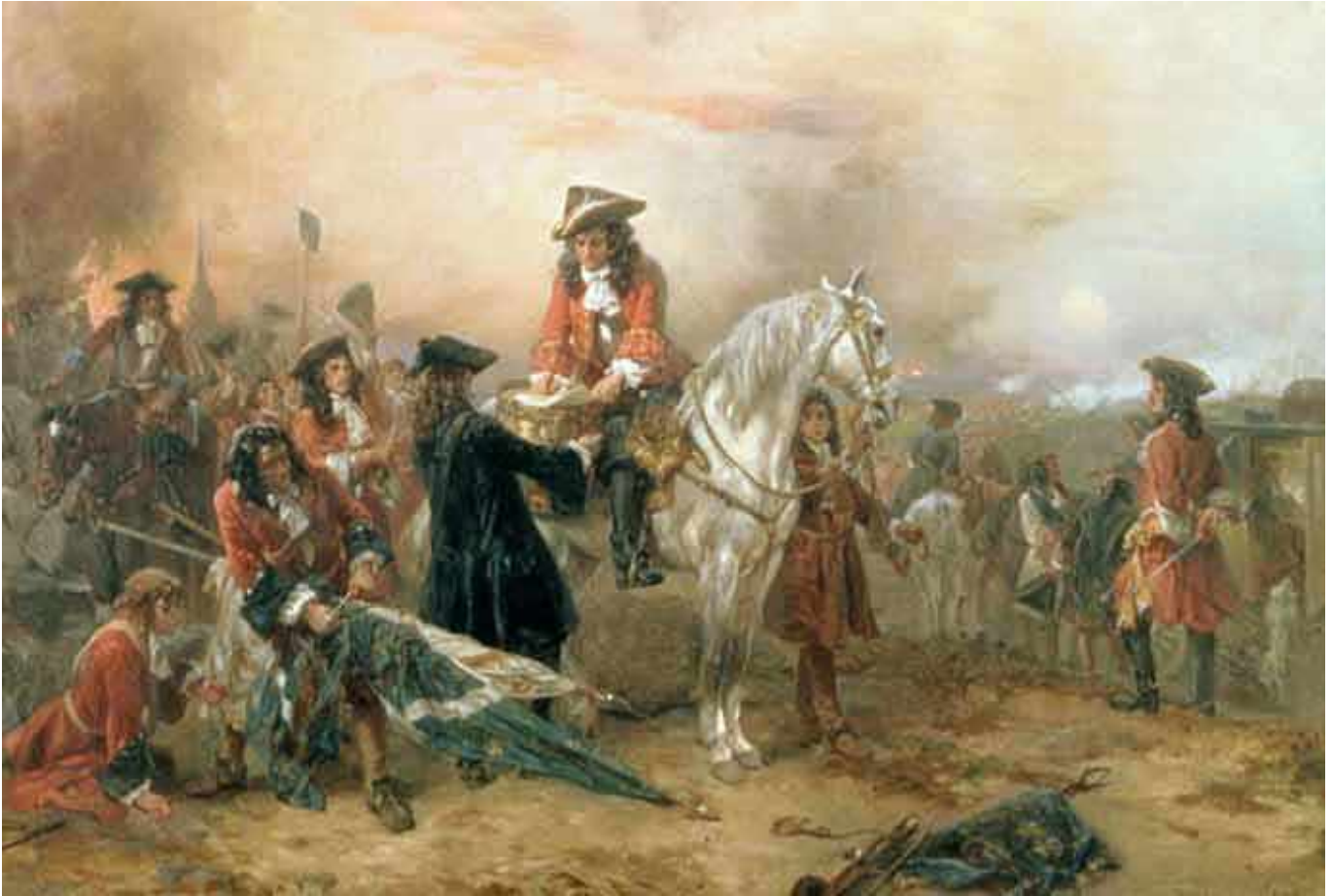
“Duke of Marlborough signing the Despatch at Blenheim”, Robert Alexander Hillingford (1825-1904)

City Council renamed Belmont Place to Blenheim Place on May 20, 1912 to honour The Battle of Blenheim (1704), lead by John Churchill, Duke of Marlborough , Captain-General of the English and Dutch forces in Europe. It was described by the National Army Museum (Royal Hospital Road, London) as follows: