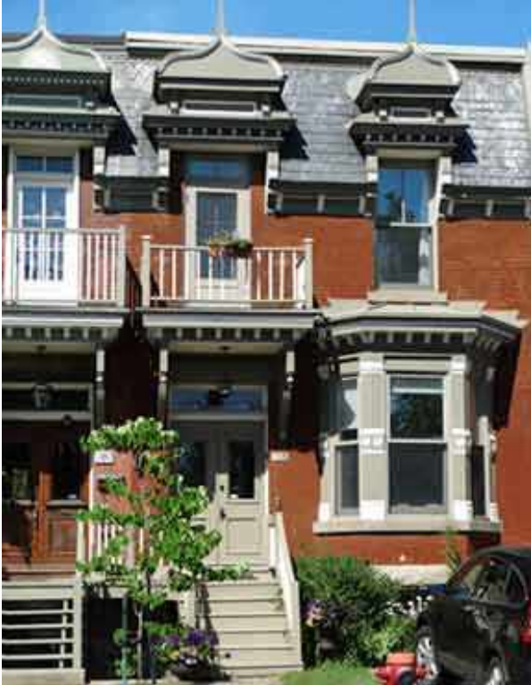
105 Blenheim Place

“The Battle of Blenheim was fought on 13 August 1704 during the War of the Spanish Succession (1702-13). A decisive defeat for a Franco-Bavarian force by the allied English, Dutch and Austrian armies, it destroyed the myth of French invincibility and earned the British Army an enduring reputation for battlefield courage and discipline.”