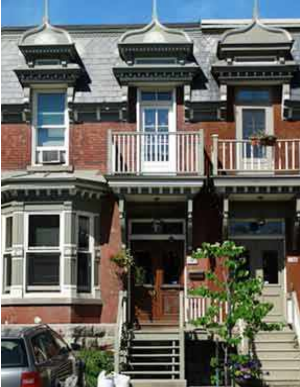
107 Blenheim Place

“Founded in the middle of the 19th century, the Dominion Bridge Company built all of Canadian Pacific’s rail bridges between Montreal and Vancouver. Over the years, this major company honed its steel expertise by working on many major structures, such as the Quebec Bridge, the Champlain Bridge, the structure of the Château Frontenac, the Mount Royal Cross and, of course, the Jacques Cartier Bridge...”