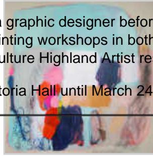
Meanwhile-Inside-My-Mind – 24x24