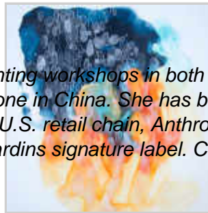
Khamsin – 40x30