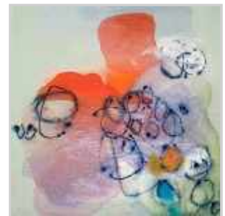
Little-Secret- 01 – petit secret 01 – 8x8