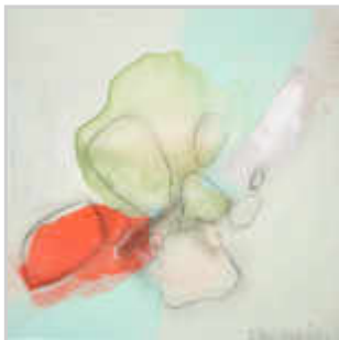
Little-Secret- 03 – Petit secret 03 – 8x8

We move from quiet works where translucent washes are overlaid with delicate under-drawings and tonal brush-marks to more forceful pieces that play with geometric shapes and bold gestural flourishes across a terrain of saturated, brilliant hues – cadmium yellow, vermillion, pthalo blue. Each painting seems anchored in its own internal reasoning and experienced moment, especially evident in the several series the artist has pursued over the last few years. Thus, there is an unabashed courage in these works emerging from what seems to be a sincere desire to know and understand the world through paint.