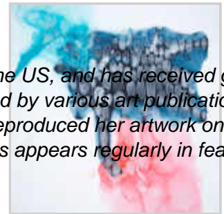
Monsoon – 40x30