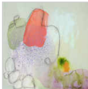
Little-Secret- 02 – petit secret 02 – 8x8