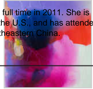
Relief – 30x24