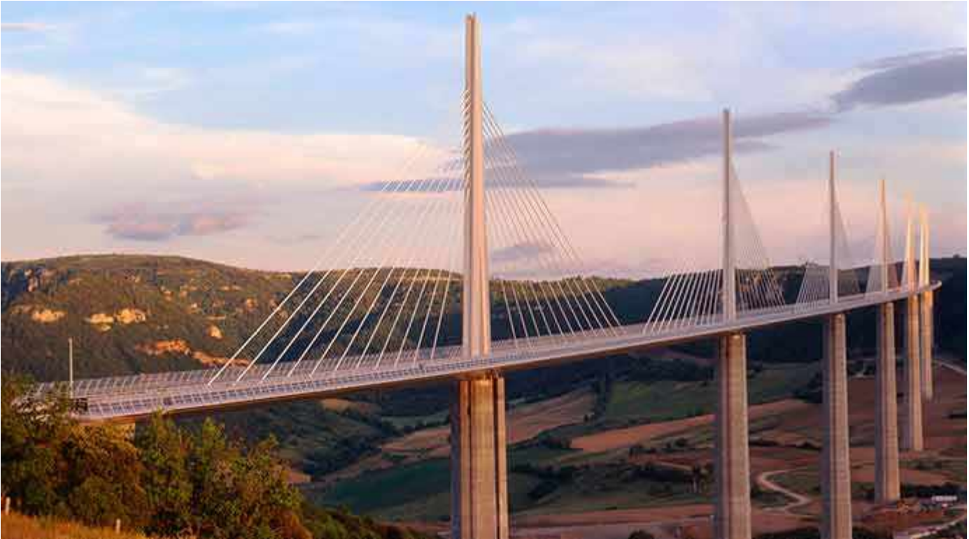
Viaduc de Millaut

We can credit Foster + Partners with several impressive achievements around the world, including the Millau Viaduct in France, a bridge with the tallest pylons in the world, and the highest road bridge in Europe that is taller than the Eiffel Tower, which for many years was the tallest structure in France; and Terminal 3 of the Beijing Capital International Airport in China, which is the second-largest terminal building in the world while being exemplary in terms of user experience, environmental responsibility and operational efficiency.