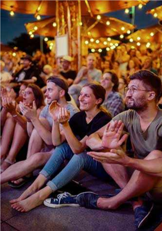
Jardins Gamelin

In August, the Cabaret series – four highly original and utterly unforgettable evenings – returned to the Jardins for a second season. And for the first time, the space was the venue for the large-scale multiplayer werewolves game Loups-Garous , a big success for everyone who participated.