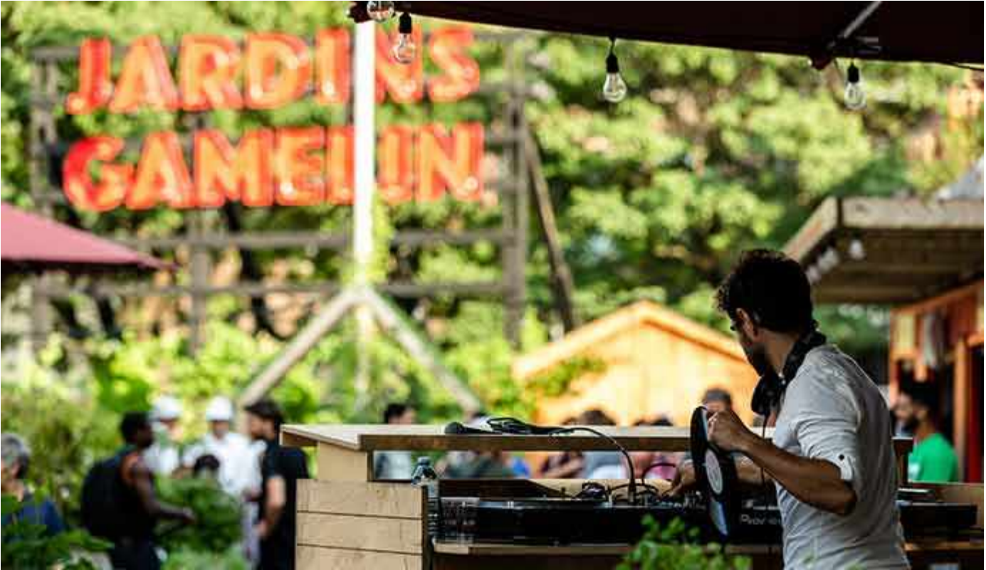
Jardins Gamelin

The Jardins' success is due largely to the exemplary spirit of collegiality and collaboration shown by a number of stakeholders, including the borough of Ville-Marie, the Montreal police service, Sentier Urbain, the Société de développement social and Jardins staff. All have contributed to social outreach and intervention at the site by sharing their expertise while tackling the challenges involved in animating the space.