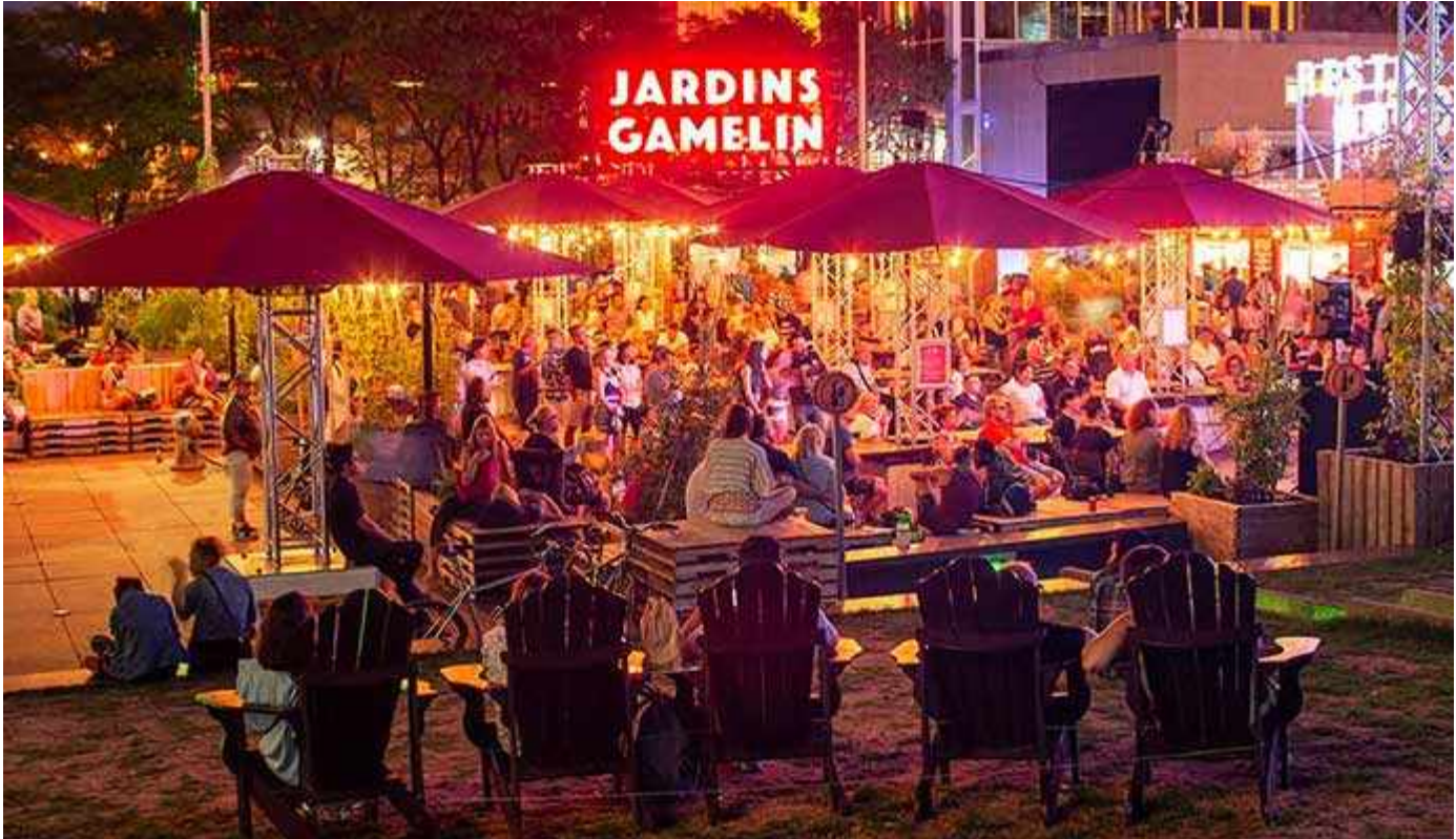
Jardins Gamelin – Ambiance soirée.jpg