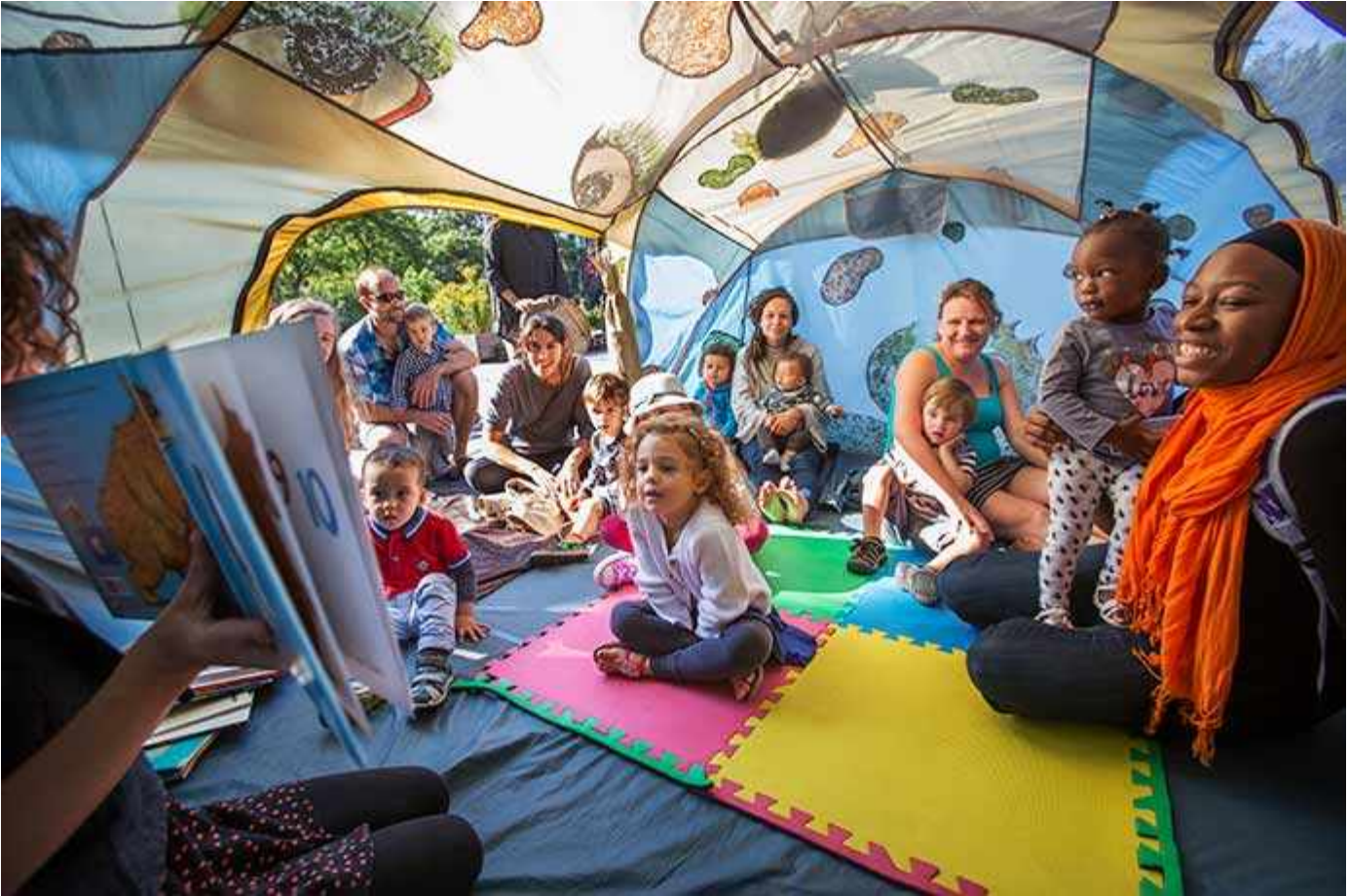
Les matinées familiales avec Petits bonheurs, Jardins Gamelin

Once again this year, Les Jardins Gamelin offered the public an extensive program of arts and culture, free of charge and 100% made in Montreal. Visitors had varied experiences, as inspiring and unifying as they were entertaining. Thanks to Sentier Urbain , visitors and passers-by gained plenty of new knowledge about urban agriculture and the environment, with more than 20 practical workshops and talks, and casual meetings with the gardeners in the greenhouse throughout the season.