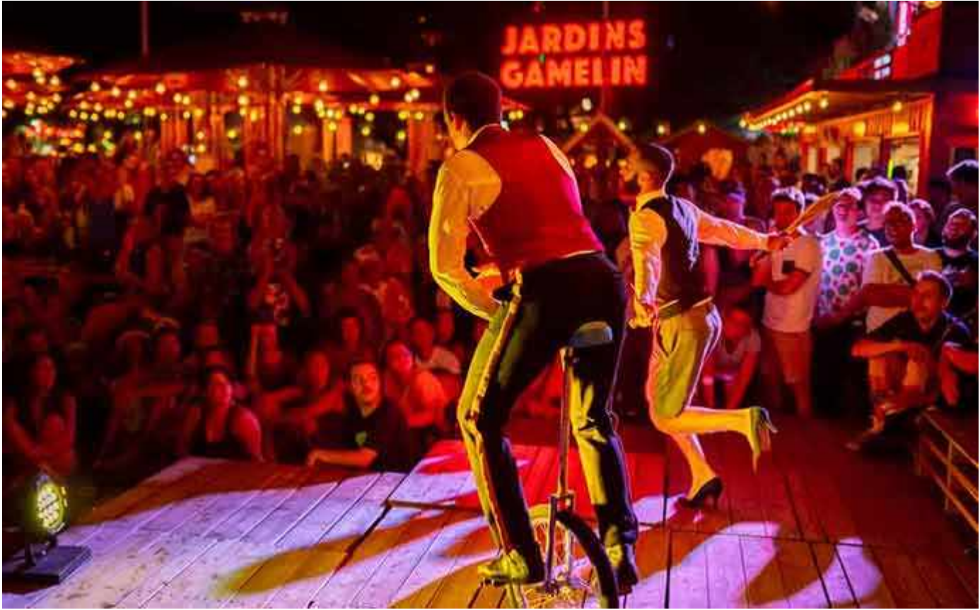
Jardins Gamelin

Each Sunday, trivia nights with Randolph brought together dozens of teams of all ages. The BANQ's discovery workshops, offering an encounter with the heritage of Place Émilie-Gamelin and nearby neighbourhoods, inspired many people to look back on bygone days. When the weather was nice, outdoor yoga and meditation sessions in the Inspirez, expirez series were more popular than ever.