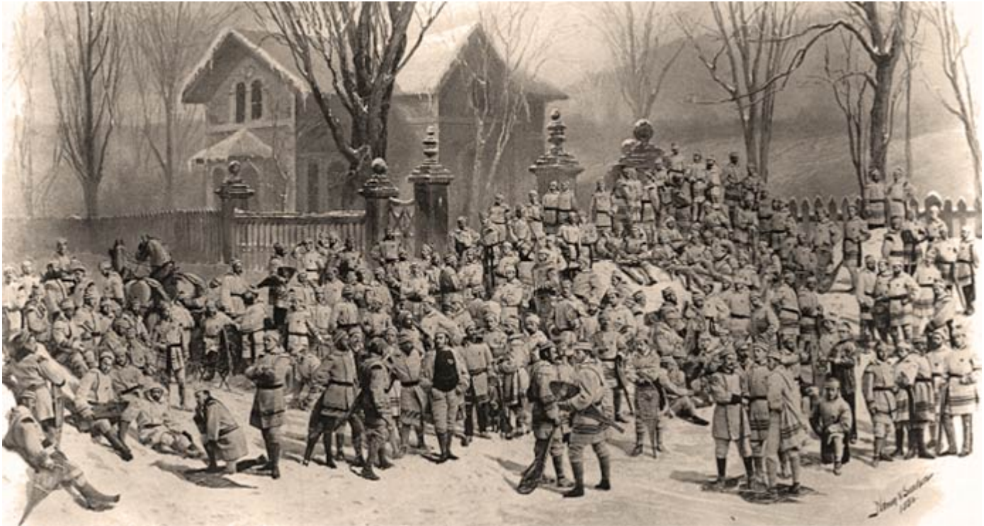
St. Georges Snowshoe Club at McGill gates, Montreal 1880