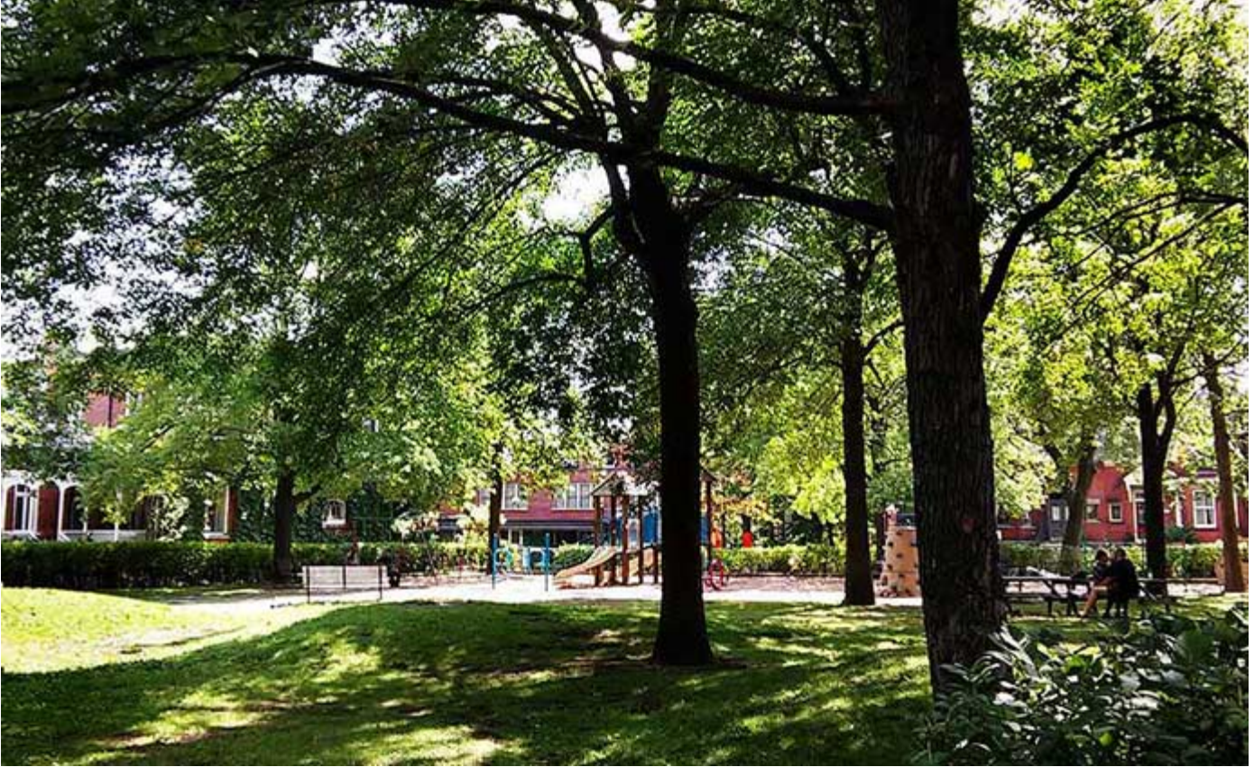
Stayner Park