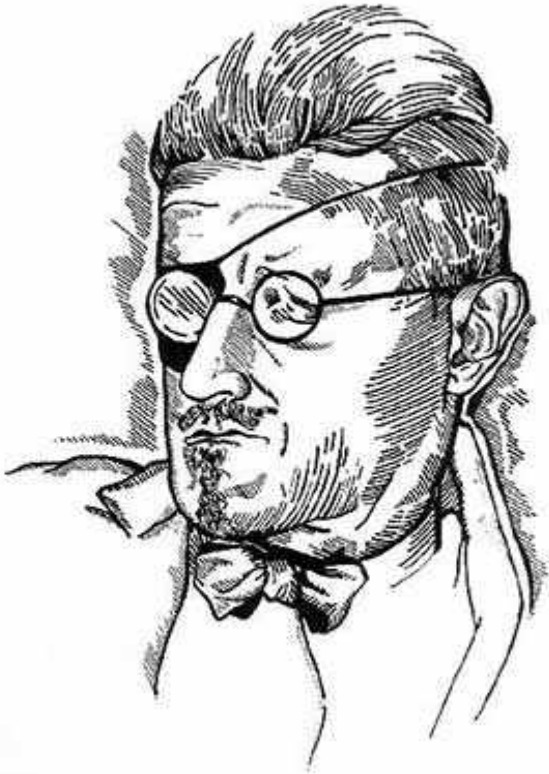
Joyce by Djuna Barnes

Montreal, which has a very rich literary history and tradition, hosts the largest Bloomsday Festival outside of Dublin . For this year's edition, Westmount Magazine published this article, Festival Bloomsday Montréal 11th edition starts June 11 .