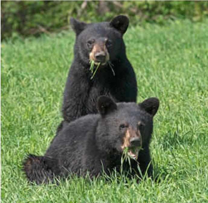
Two-year-old black bears